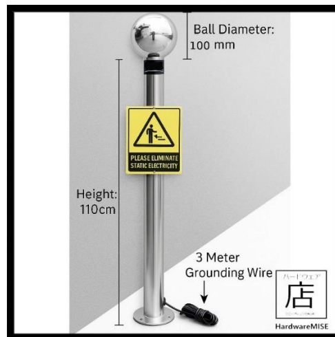
Figure 2: Electrostatic Discharge Stand for human body static discharge, an alternative to ESD straps