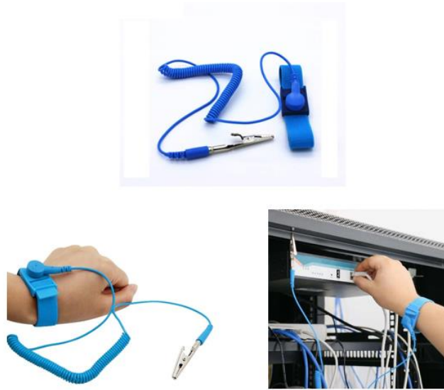
Figure 1: ESD straps should be used to prevent permanent damage to sensitive electronic components

Verify that applied supply voltage and current limits do not exceed the ratings of components, ICs, probes, and breadboards.