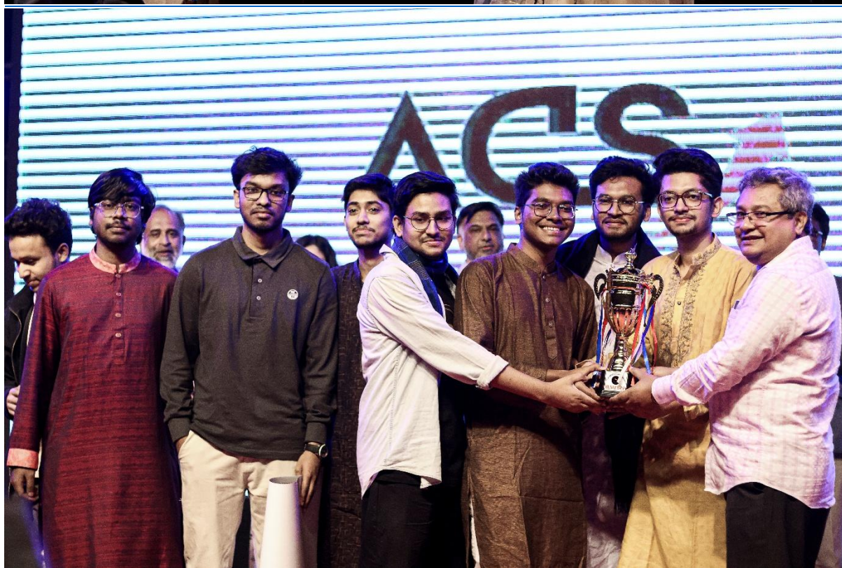
Honorable Sponsors and teachers giving the prizes to different competition winners