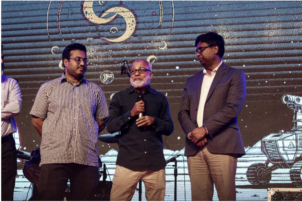
Honorable head sir and convenor sir shared short speeches on the grand cultural night