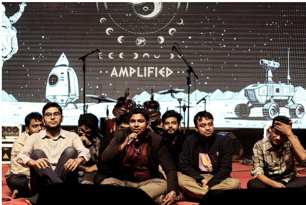
Alumni from different batches shared their experiences