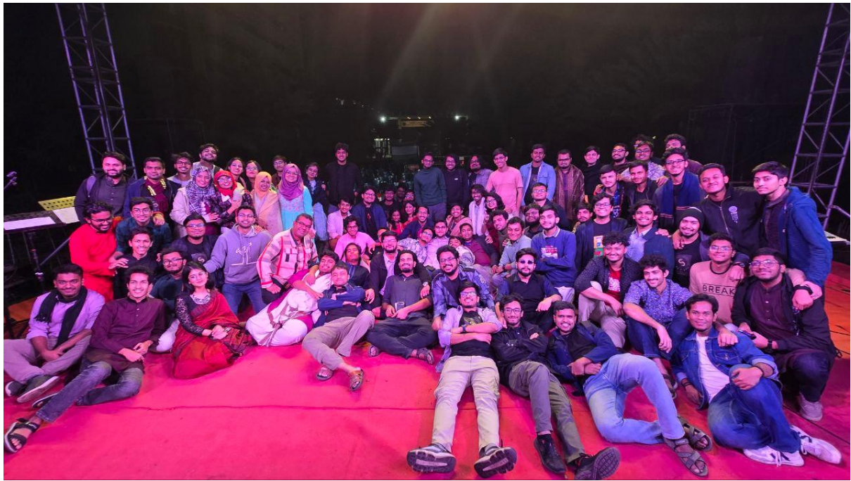
A photo combining the current students and alumni in one frame.