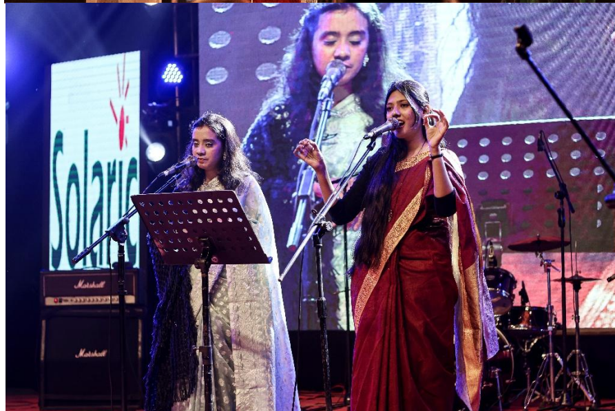
Different cultural activities by the students